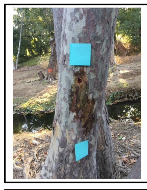
Photo 2 – Photo of the tree trunk showing distribution of holes on trunk and/or branches.

Place a piece of brightly colored painter's tape or flagging at the highest and lowest point of distribution. This will be the second tree in your series if your first photo contained a beetle hole. If this tree is absent of beetles, take a picture of the tree's trunk.