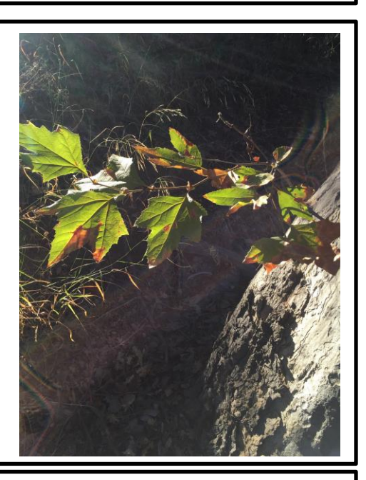
Photo 3 – IMPORTANT: Photo of leaves, flowers, and/or fruit to identify tree species.

Place a piece of brightly colored painter's tape or flagging at the highest and lowest point of distribution. This will be the second tree in your series if your first photo contained a beetle hole. If this tree is absent of beetles, take a picture of the tree's trunk.