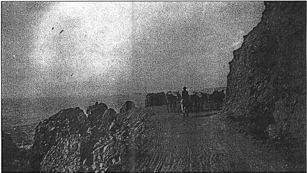
TOPANGA HISTORICAL SOCIETY